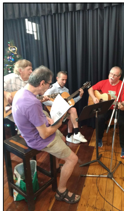
Christmas Music at The Winsome