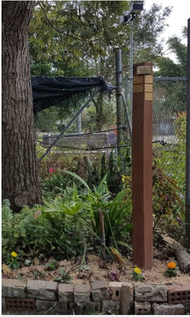
The pole at the end of our garden, where we remember those who have passed away.