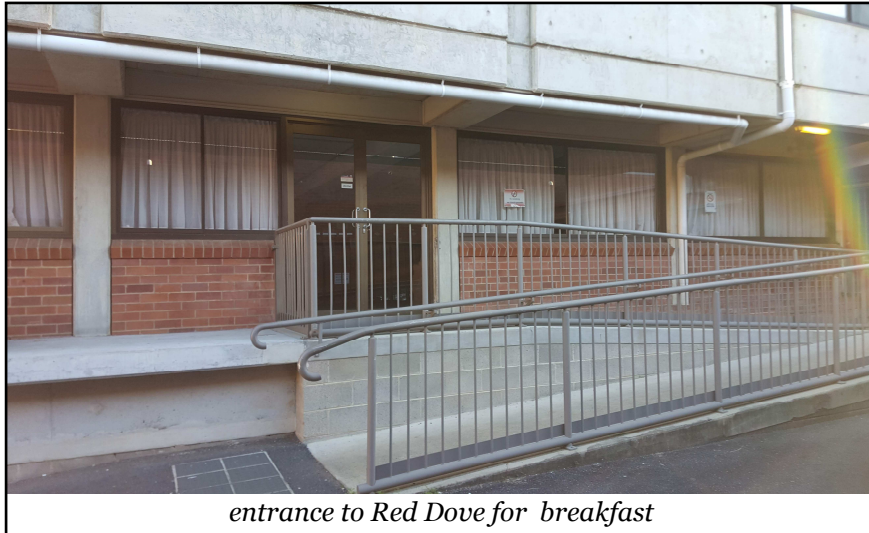
entrance to Red Dove for breakfast